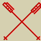
SKI Poles 93.75$