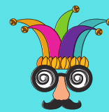
Silly Hat 30.36$